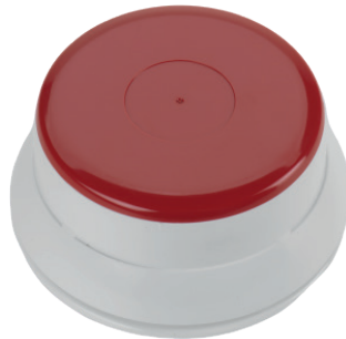
Red blanking cap