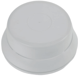
White blanking cap