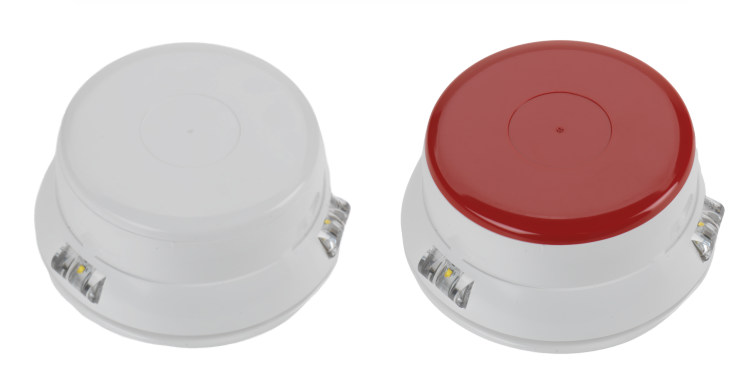
White blanking cap