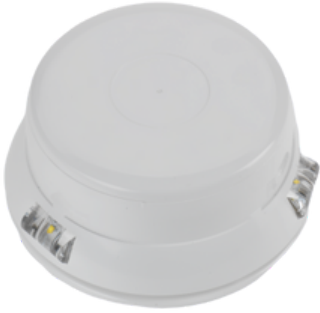
White blanking cap