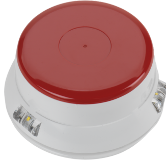
Red blanking cap